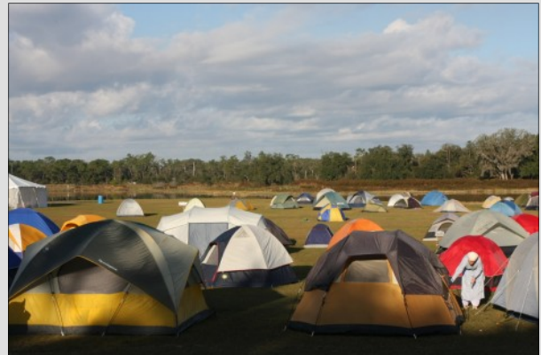
Tent city at Winter Solstice