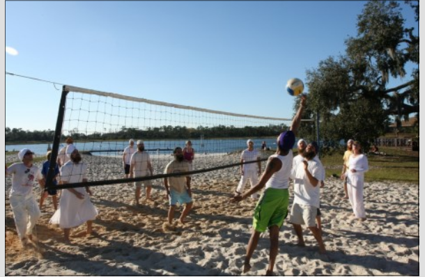
Volleyball by the lake