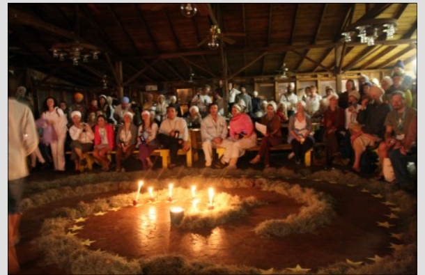
Children's program by bonfire

Who knew Winter Solstice could be so much fun! The reports are the weather was beautiful (in the 70's) and Tantric was over every day by 1:30 pm!