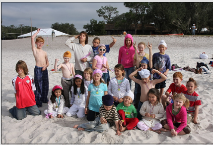
Children's camp at Winter Solstice See more pictures on page 6.