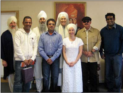
Sangat members with a Bollywood director and crew, here to make a film in New Mexico.